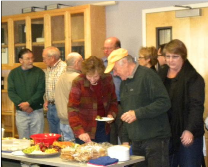
The attendees enjoying the lunch provided by the Trinity County Republican Women.