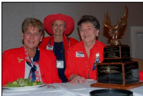
Advocacy Photos by Diana Sheen

TCRWF Ladies, every Advocacy is new. UNTIL THEN, ALWAYS STAY IN FOCUS